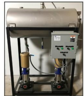
Boiler Feed Systems