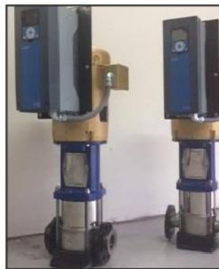
Variable Speeds (VFD)